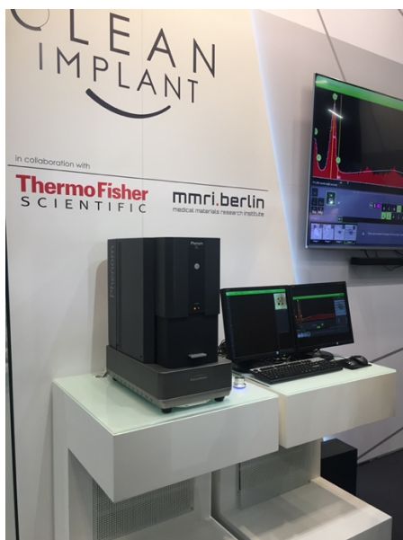
Fig.2: SEM testing station at the IDS